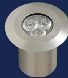
Large Well Light