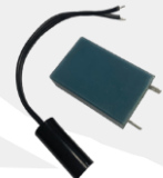
Primary and Secondary Surge Protectors