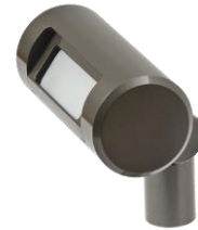
Wall Washer 9W Flood AB