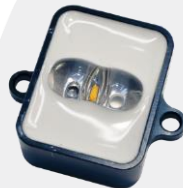
Owl Micro Series 1W Linear BLK