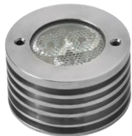
S3 Submersible Super Saturn 6W 40° SS Blue