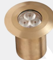
Well Light 4W 25° BR Royal Blue