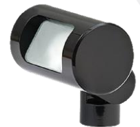
Mini Wall Washer 2W Flood BLK