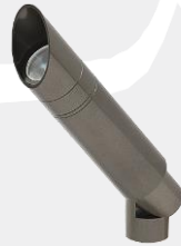
Mini Spotlight w/Leg 2W 25° AB