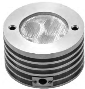
SUPER SATURN 3