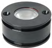
SATURN 1 HALO