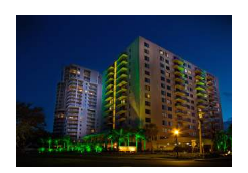
ENHANCE the curb appeal of your property.

Outdoor lighting is a crucial part of building that environment. It starts with choosing the right LED technology and fixtures — with Garden Light LED and our National Network of Certified Master Dealers, we handle everything from design, to installation, to ongoing maintenance, which makes us unique in this market. We use premium fixtures to match the look and feel of any property, and specialize in beautiful, and seamless, landscape lighting integration.