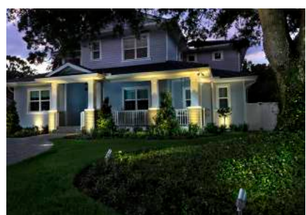
REALIZE greater savings on energy and maintenance costs.