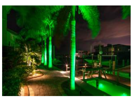
ELEVATE the guest experience.